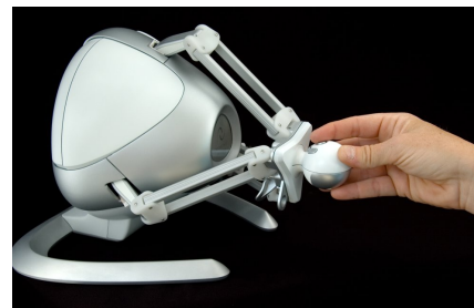
Fig. 1. The 3D haptic Device, Novint Falcon

The haptic device used in this project is Novint Falcon, shown in Figure 1. It is a high resolution, 3-d commercial (3-d translation) haptic force feedback device. The workspace of Novint Falcon is about 4 inches cubed and the force capability is 10 N. It has a low price of $200 and is therefore a reasonable device used in training systems. Novint Falcon is a impedance device: the input to the device is position, while the output is force. There is the another type of haptic device, admittance device. The input to a admittance device is force, but the out put is position. The impedance control is easier than the admittance control, because it does not have a force feedback. In impedance control, the force needs to be controlled even if the desired force is zero.